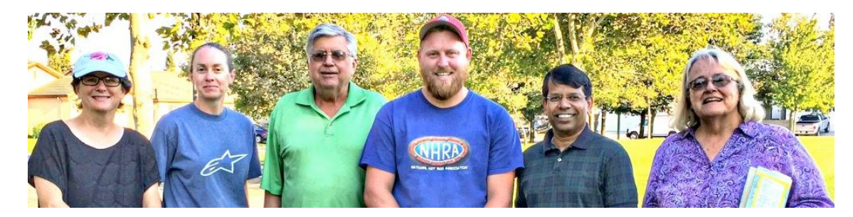
Planning team / WONA board

Most of our Woodcreek Oaks Board, their sweet families & awesome guests from Roseville Fire!